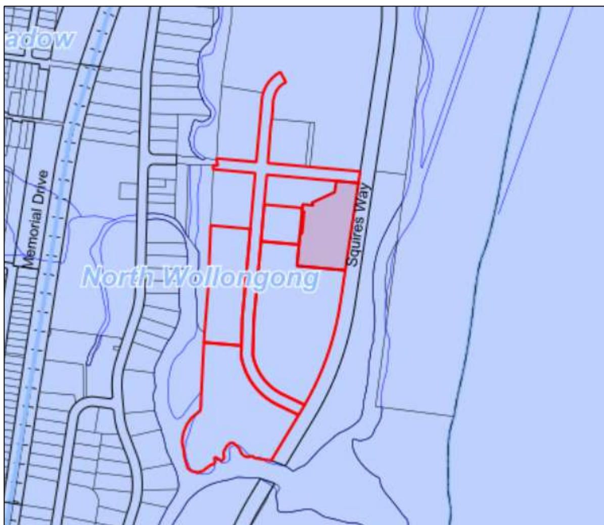
Figure 4 - SEPP (Resilience & Hazards) 2021 map extract - red outline denotes subject site