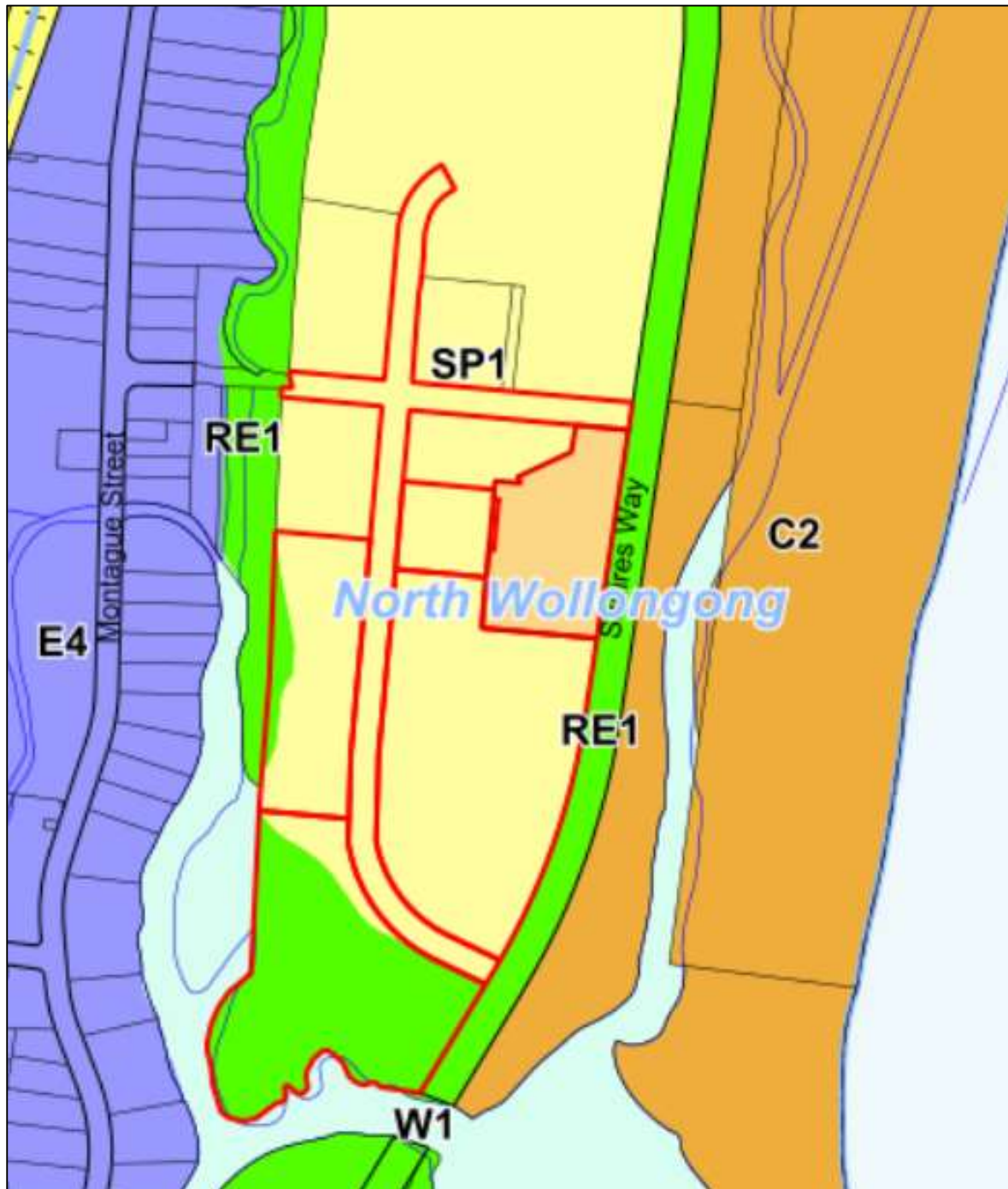
Figure 1 - WLEP 2009 Zoning Extract – subject site outlined in red