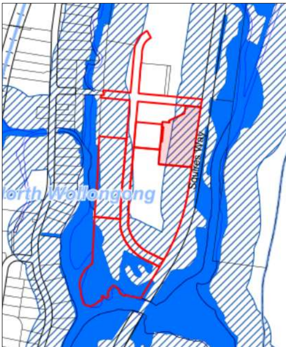
Figure 3 - SEPP (Resilience & Hazards) 2021 map extract - red outline denotes subject site